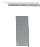
Side and top riser